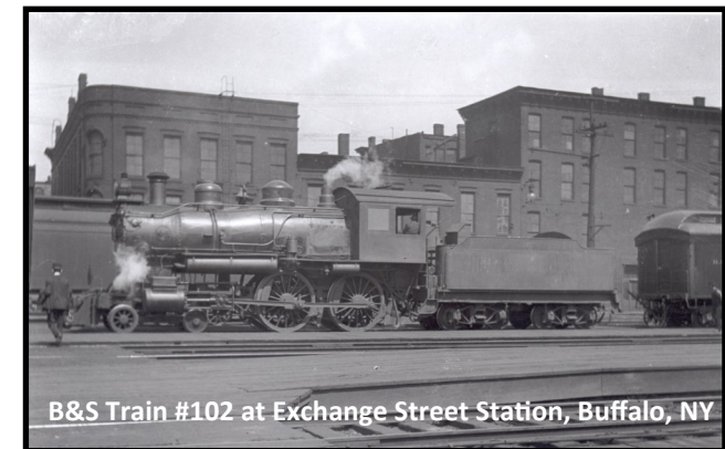
B&S Train #102 at Exchange Street Station, Buffalo, NY