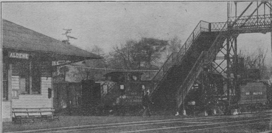
The Central Railroad of New Jersey Pays One Dollar a Year Rent to the Rahway Valley Because Part of the Central's Station at Aldene is Located on the RV's Right-of-way