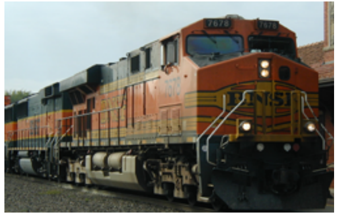
Taken at the Gainesville depot