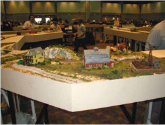
David Loupot's module scene