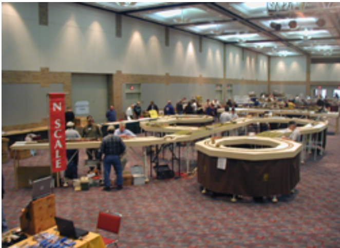
View of entire layout