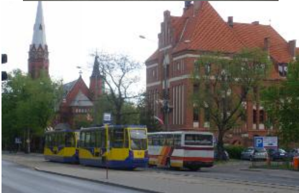
Figure 3: Street Trolleys in Torun, Poland