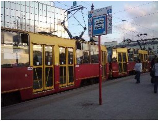
Figure 2: Street Trolleys in Warsaw, Poland

When we traveled to the small town of Torun, we again found a street trolley network. This town is quite a bit smaller than Warsaw, and I believe the trolley network traveled along just the main street through the town. Again, we found a mix of older cars and new modern cars. You can see in the second photo below that the street trolleys and the traditional buses manage to share the roadway without any problem.