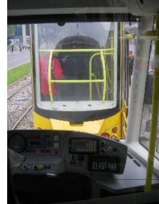
Figure 1: A Modern Street Trolley in Warsaw, Poland

In Figure 2, you can see additional photos of some of the Street Trolleys that I saw in Poland. The network consisted of both the newer cars as well as older cars that seemed to be maintained fairly well.