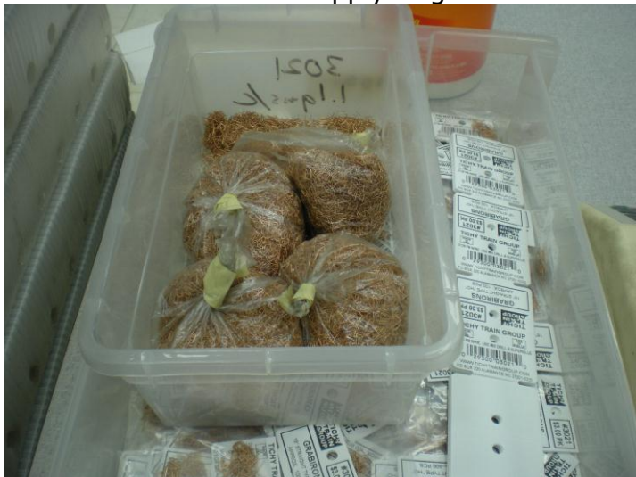
Here is a lifetime supply of grab irons.