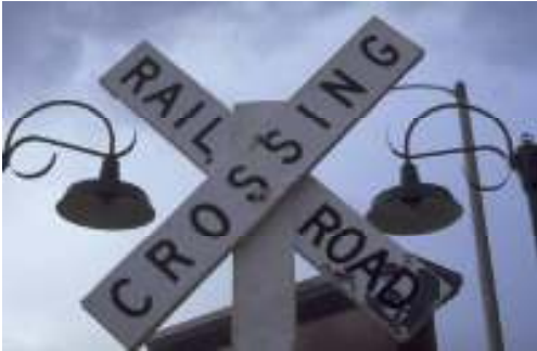
Carolina Piedmont Division, Mid-Eastern Region of the National Model Railroad Association

July 2008 Newsletter of the Carolina Piedmont Division, MER, NMRA