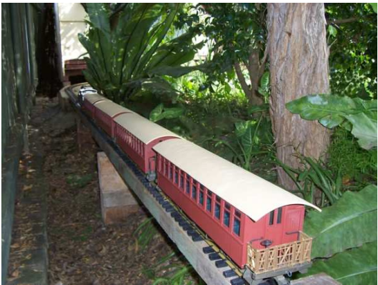
At Sundial Junction our train takes a curve to follow fence line. It is now heading for Orange Junction (under the Orange tree).