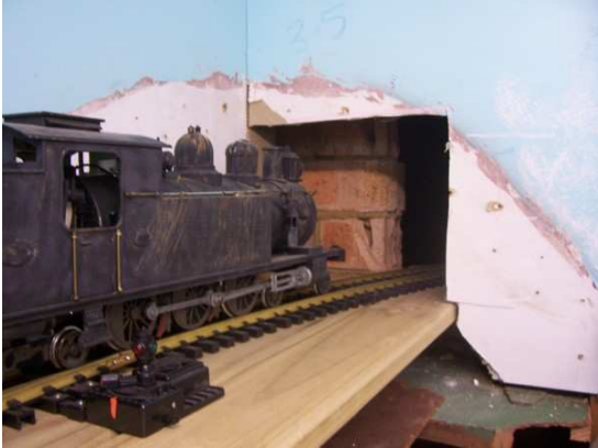
Here the BTR D16 Class 4-6-4 Loco with a 4 car Passenger train is started on the level in Basement. Our train goes through wall into area under front stairs.