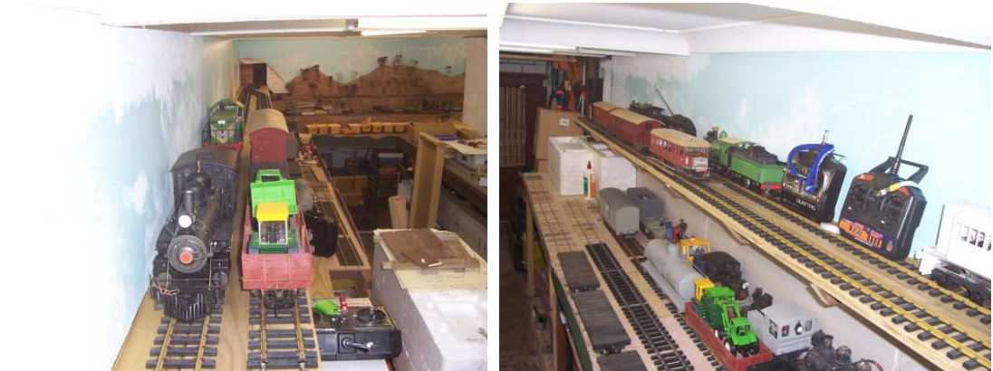
Alternately the train can continue on to the Fiddle Yard where it can be handled similarly.

There is enough head room here to remove rolling stock onto storage shelves or into boxes.