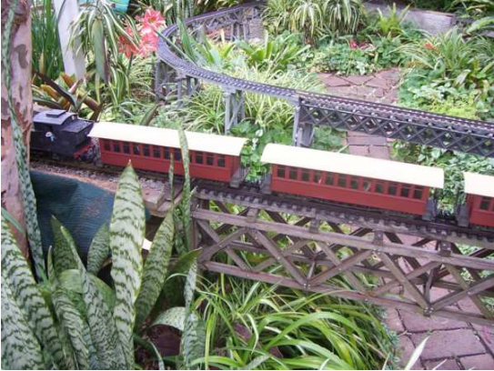
Our train rounds a curved trestle to cross Goanna Creek then we arrive at Shenanigan's.