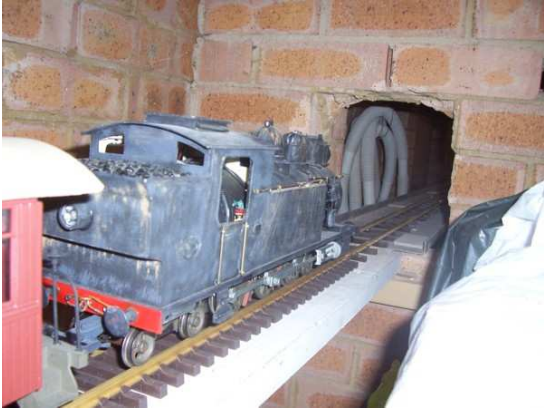
Under front stairs, the gradient changes to 2%. Now, another hole in a wall under the front door.