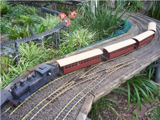
Train arrives on middle road, then crosses to platform road into Station.