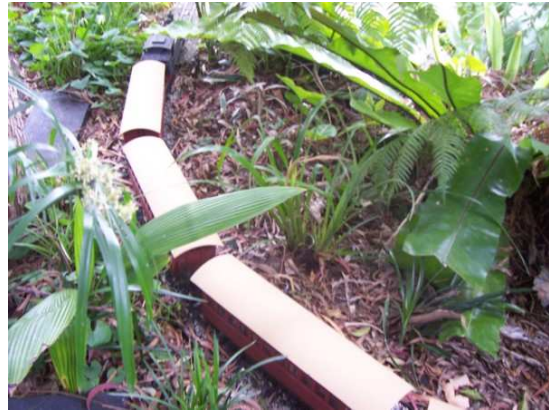
A loop on the East side of Shenanigan's Station, enables trains to run East then turn South.