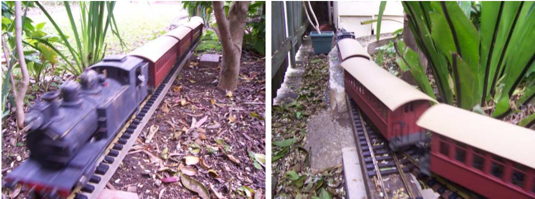
Then leaving Sundial Station, run back to Orange Junction and back up to Shenanigan's in a continuous loop.