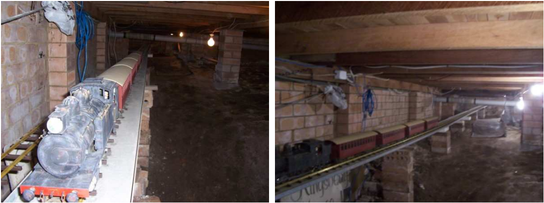
Our train first enters the crawl space where grade is eased from 4% to 2% to slow train down.

There is enough head room here to remove rolling stock onto storage shelves or into boxes.