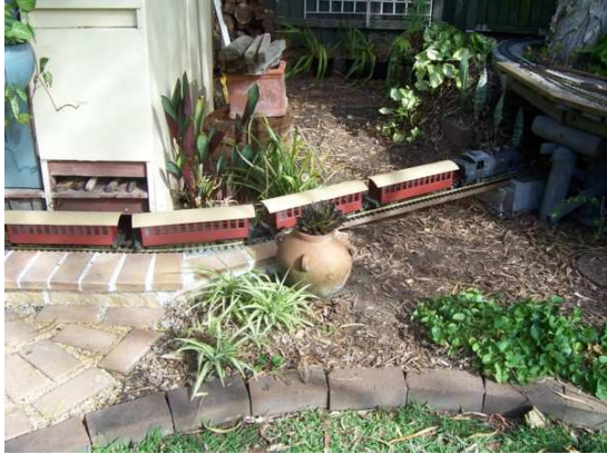
The platform at Cubby Halt, grade is eased here and level through platform. There is a low profile bridge across pathway, the trains go under Trestle table.