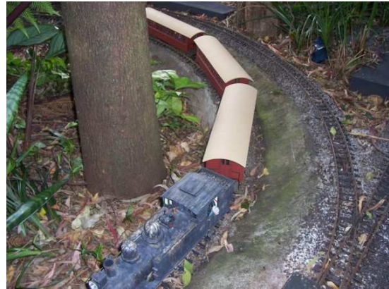
These trains rejoin the South Coast Line at Amber Junction then enter the Spiral.