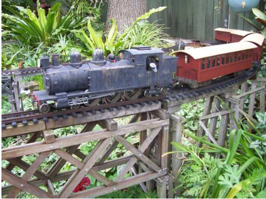
Next, Amber Junction where we cross to the left track.