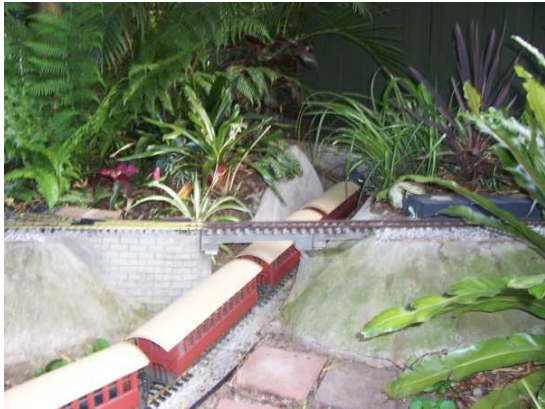
Next it goes under Spiral Junction bridge to traverse the spiral gradient of 4%. The train still working up grade under bridge.