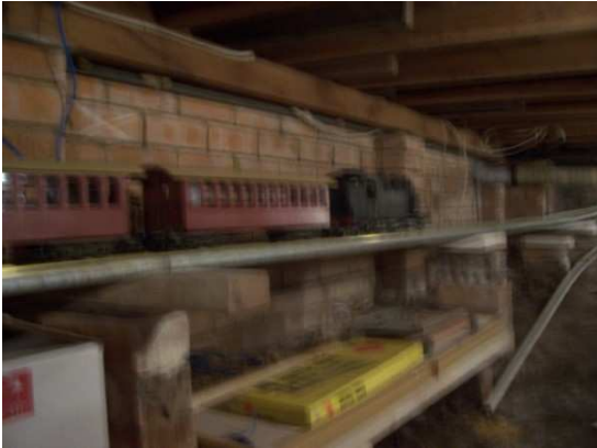
Still at 2% grade here. Then, we ease the gradient up to 4% ready to exit into the Garden.