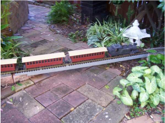
The train emerges into Garden at the locality known as 'Hole-in-the-Wall'. Train crossing the Pathway bridge.