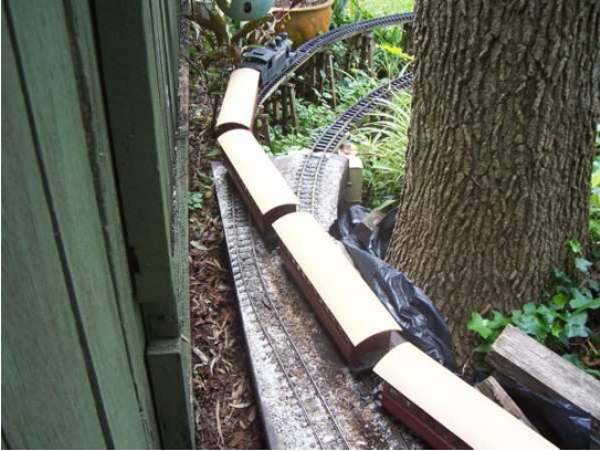
At summit of spiral it joins main line at Spiral Junction.