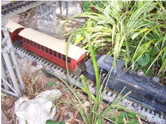
The station platform at the locality of Skink, the station building is yet to be built. Train about to enter the Spiral.