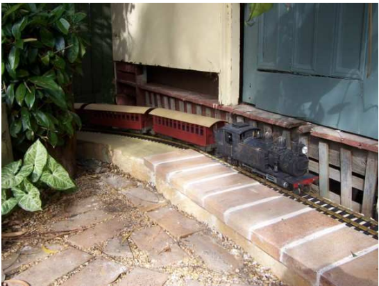
Passing through Orange Junction and entering Cubby Bend. Here it is entering 'Cubby Halt' platform.