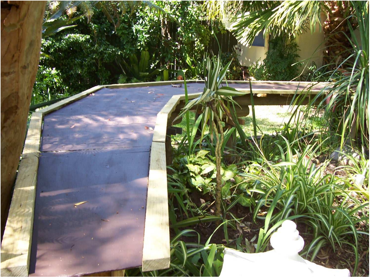
The BTR - "Trestle Table" – how it was made.