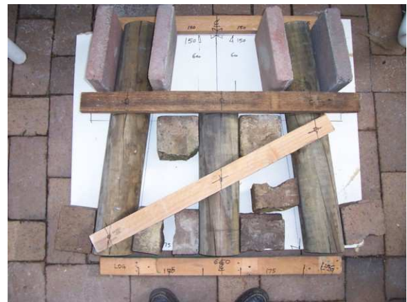
The jig used to assemble the Bents.