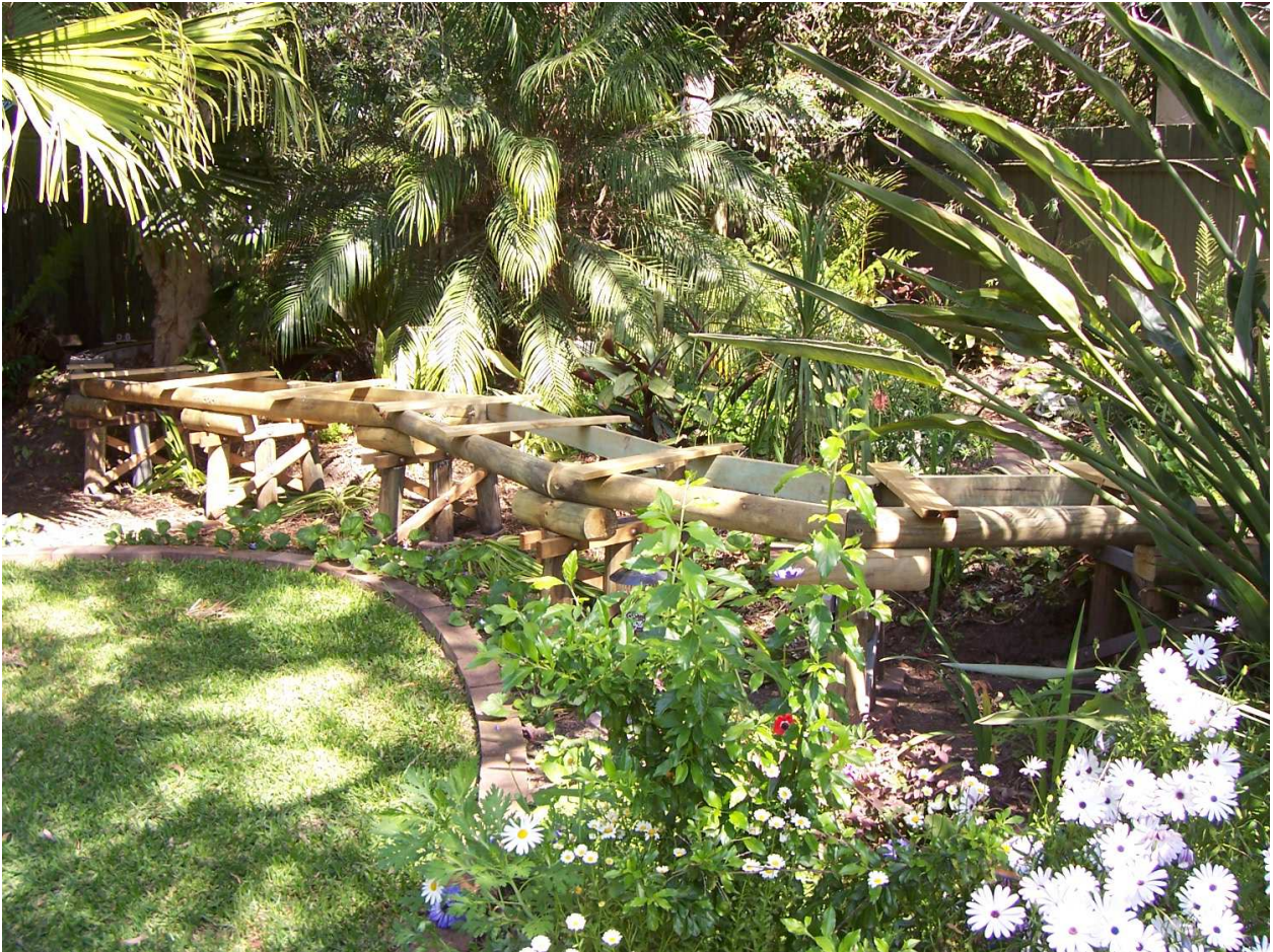
Treated Pine slats were laid on Girders.