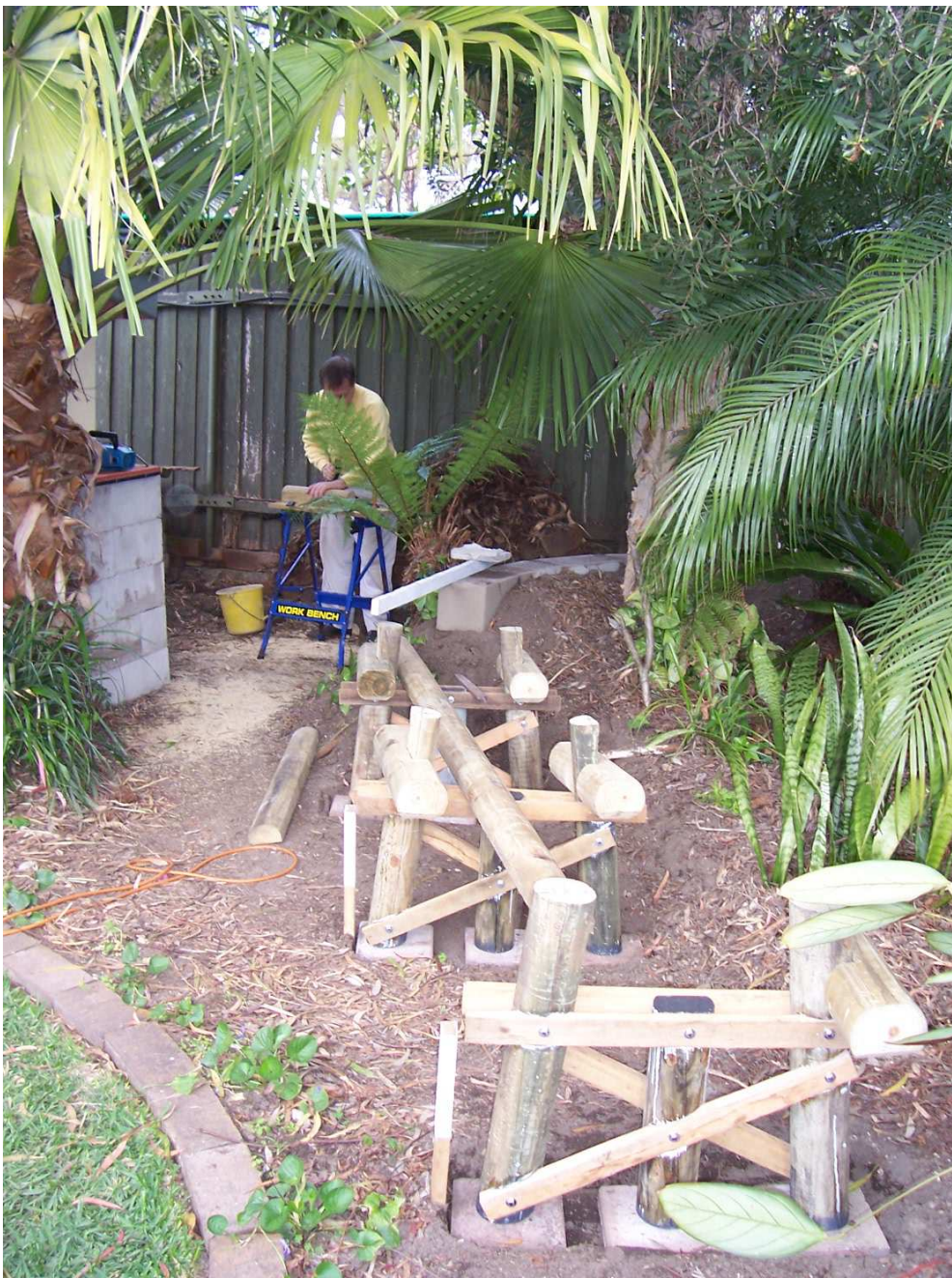
Bents aligned on concrete pads, corbels and girders being installed.