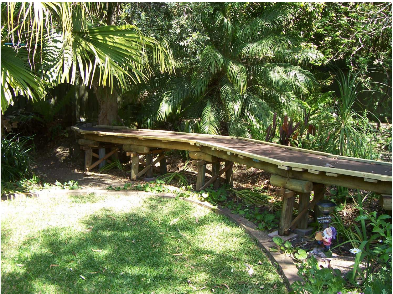
Fibre cement sheet panels laid over slats, track and ballast laid onto painted sheets.