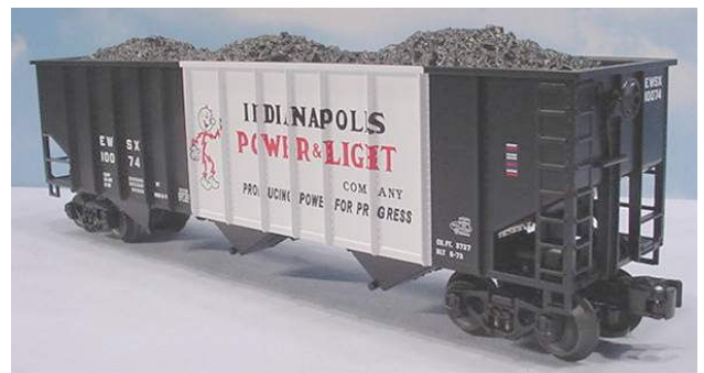
Lionel 6-17179 2002 vol 2