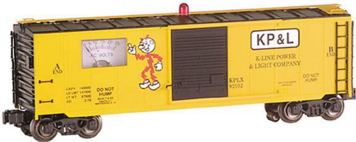
K-Line K7041-8011 2004 vol 1