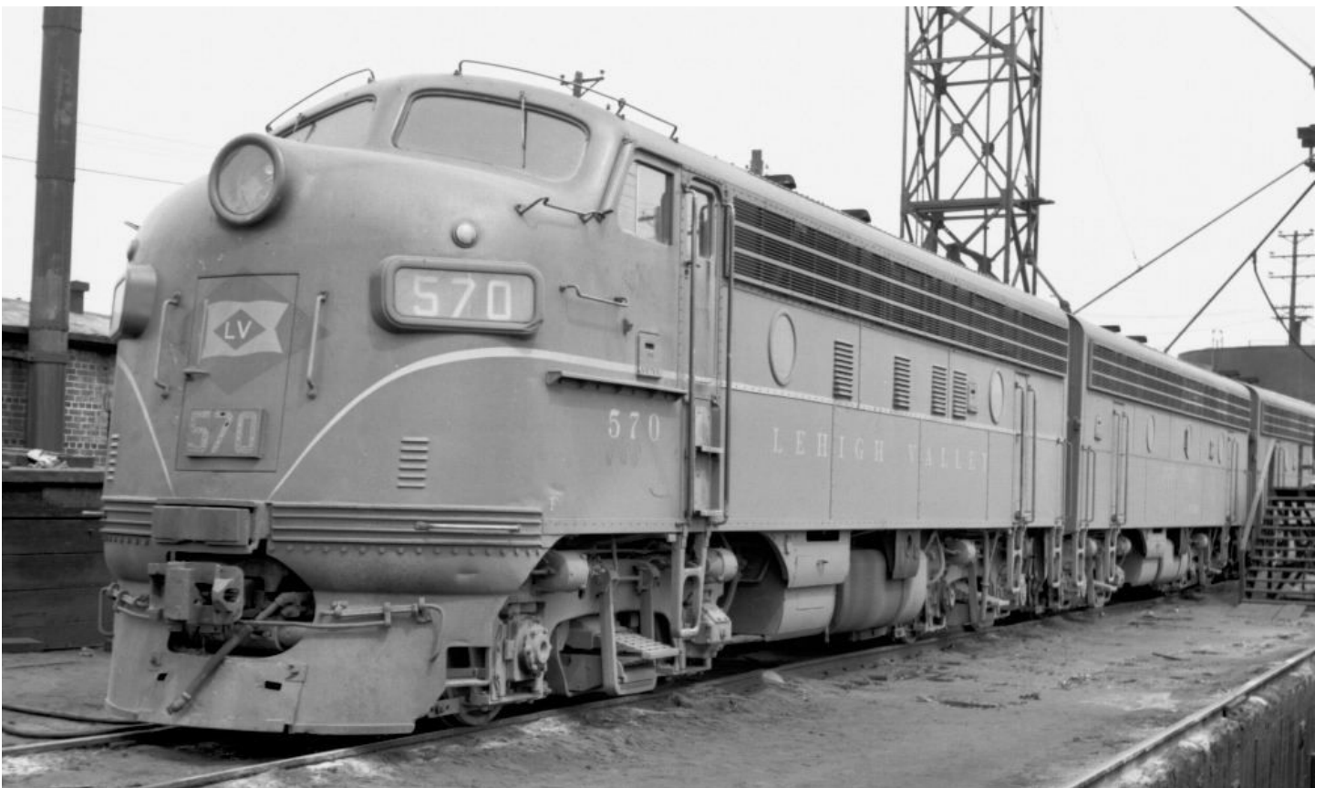
LV F7A 570 04/25/67