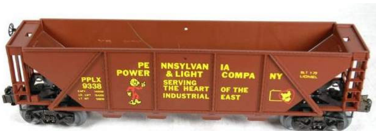
Lionel 6-9338 1979