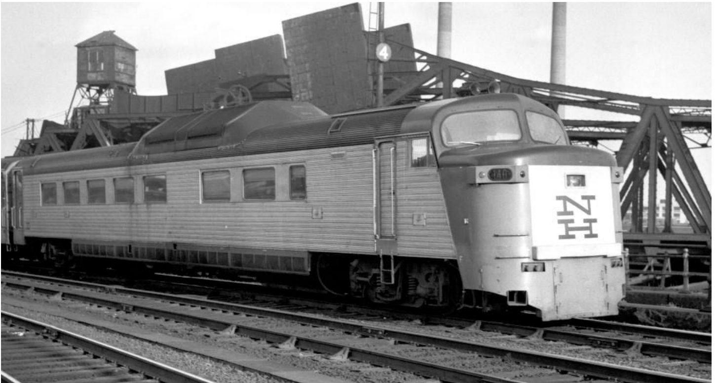
NH RDC 140 Boston 11/26/57