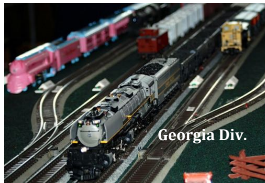
Original American Flyer by A. C. Gilbert