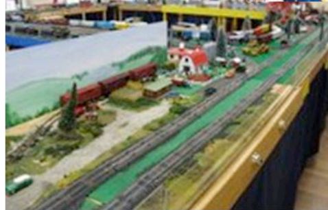
AMROC, Columbia, SC