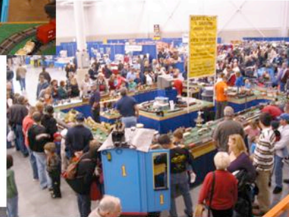
World's Greatest Hobby Show, Hampton, VA