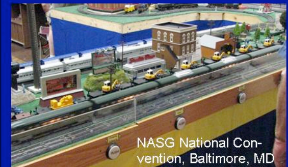
NASG National Convention, Baltimore, MD

The Atlantic Coast S Gaugers is a nonprofit club which does not discriminate on the basis of scale, gauge, race, creed, or color.