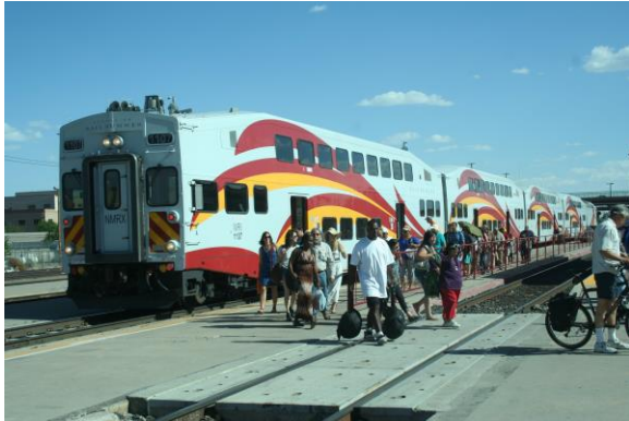
The New Mexico Rail Runner at Albuquerque