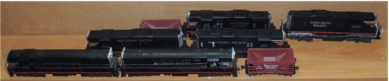
Larry Stephens' Locomotives: All are Athearns. The 2 FM Trainmasters are the leading engines with 40 ore cars followed by an SD9 and GP9 at the middle, then 40 ore cars with 2 GP9s pushing. The Trainmasters are old and need some repair. The EMDs are new out of the box and are receiving decoders, detailing and weathering.