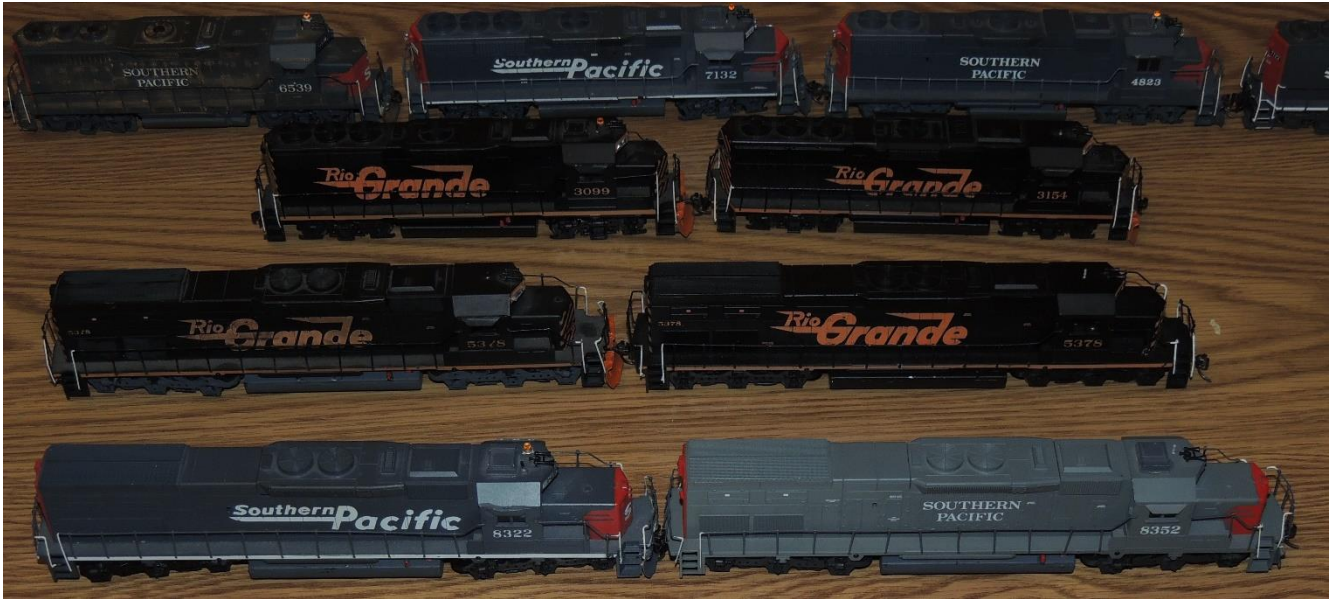
Leigh Swan's Locomotives: Four Southern Pacific Athearns with the lead being an Atlas. All sets are speed matched with the same address. Rio Grande are two GPs and two tunnel motors.