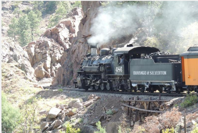
Freight, westbound. Photographed: approaching Monarch, Colo., June 6, 1942.