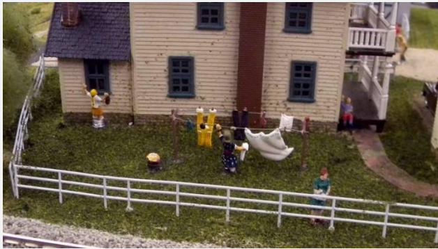
A busy back yard