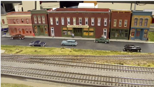
Small town busy street