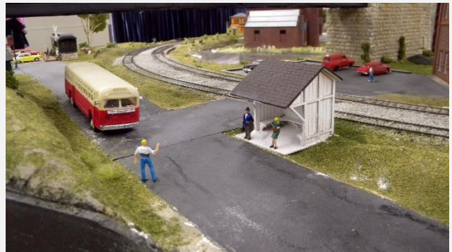
A local bus stop