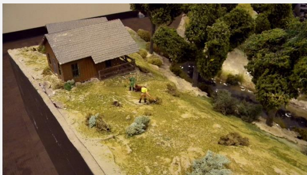
Hunters at the cabins