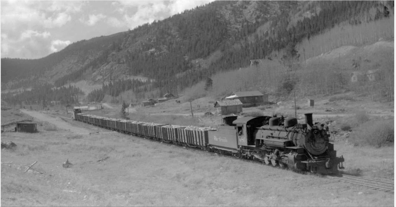
Freight, Eastbound; 13 cars. Photographed: below Monarch, Colo., October 11, 1942.