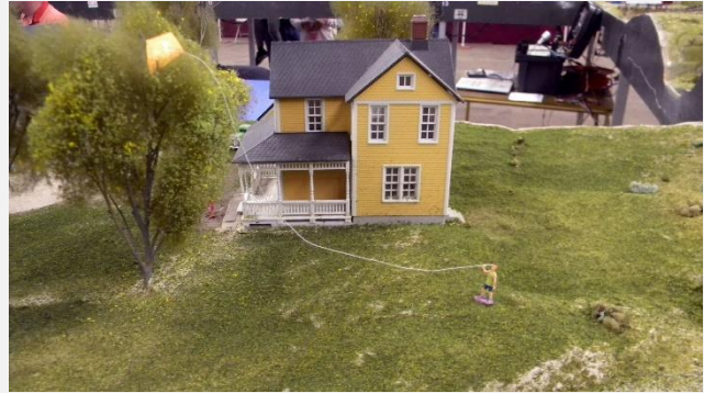
His kite got stuck in a tree